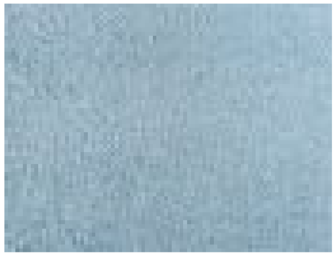
2611 SKY BLUE