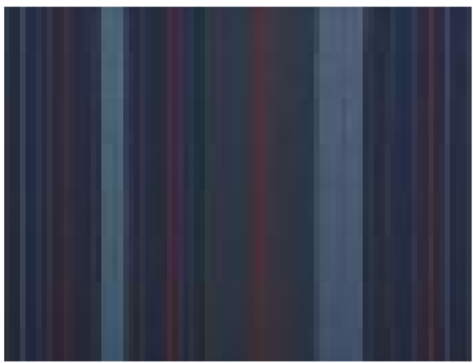
4612 COBALT BLUE