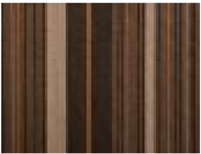
4624 AMBER BROWN